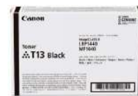
Toner T13 (Yield up to 10,600 Pages)

Canon eCarePAK Canon Extended Service Plans offer coverage beyond the standard one-year limited warranty 10 up to four years.